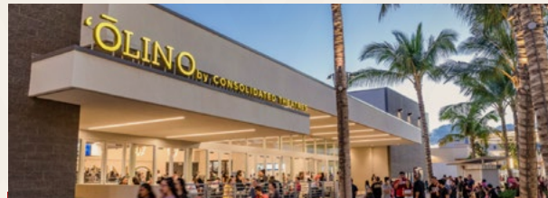
Ka Makana Ali'i