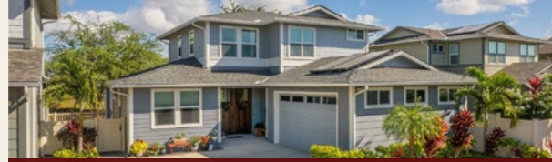
Coral Ridge by Gentry