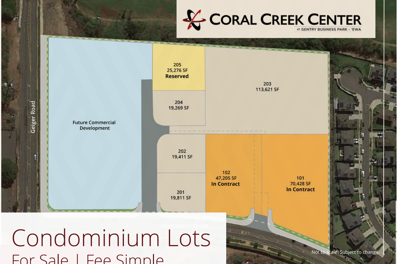
Not to scale. Subject to change.